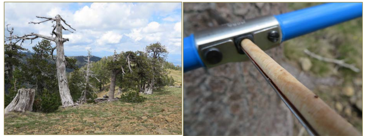
Figure 5: Ancient living and dead trees in the northern Pindos range of Greece (right). An increment core from a living tree. Coring a tree does not harm the plant yet still provides us with the necessary information for our studies (left).

This year the focus was on finding more sub-fossil wood laying on the ground or in the sediments in the vicinity of the trees that were sampled during the first expedition in 2011. In 2011, 700 year old living trees in the northern Pindos range not far from the small village of Samarina (the highest village in Greece, 1650 m) were luckily found. with the combination of these two archives Paul hopes tol be able to reconstruct a history of climate back to the late Roman period.