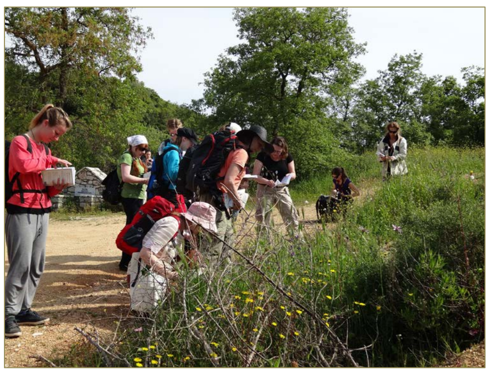
Figure 7: Students and Professors during their visit to Polylimnio waterfalls.

The second Masters course <u>"Plant Biodiversity and evolution - a global perspective"</u>, took place at NEO on April 20–27. Catarina Rydin was the instructor of the field course and in total 20 participants from Stockholm University and the Swedish Royal Botany Garden attended the course. During the excursion, they identified more than 250 plant species in a number of different sites mainly in Messinia. Among them, the Gialova/Navarino Bay area, Taygetos mountain, Polylimnio and the surroundings of NEO.