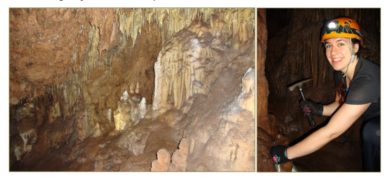
Figure 4: The upper north chamber (right) and happy Meighan taking a sample (left).

climate and calcite data. Stones collecting calcite were left in place to continue the modern calcite record. New glass slides were placed out, and drip water was collected for analysis of water chemistry. Measurements of cave humidity, CO2 levels, and drip rates will were taken in two sites of interest in the cave. A few samples of speleothem material were extracted from the cave under the supervision of the Ephoreia. If of sufficient quality, these will provide insight into local climate during the past five-thousand years.