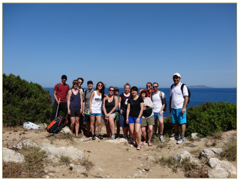
Figure 8: Ecohydrology course at NEO, a group foto.