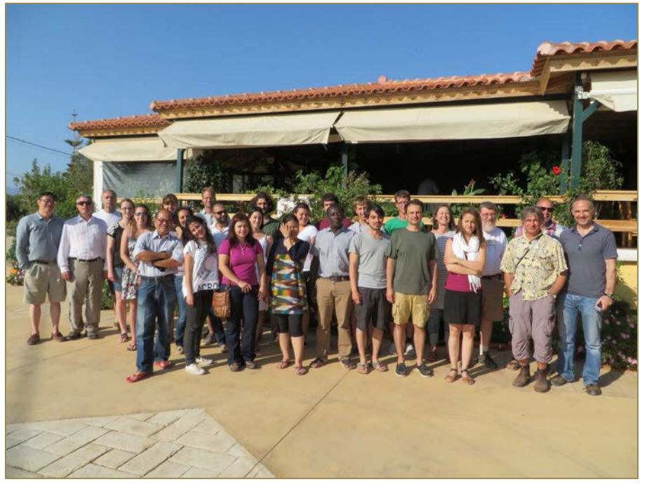
Figure 9: Bolin Centre – NEO Summer school on the sub-tropical frontier, June 23rd to July 3rd, 2013.

• From all over the world came students and faculty to attend an advanced studies, summer school on the subtropical frontier. The tropical regions of the world, which includes the Mediterranean are expanding. How fast and where this expansion will be greatest, and what will the implications to current climate conditions be, was the focus of this course. The course was delivered in a colloquium style where many invited scientists from as far away as Australia and Hawaii came to explain both the basics and current research in the field. The summer school was also well attended by students from all around the world, including many from Greece.