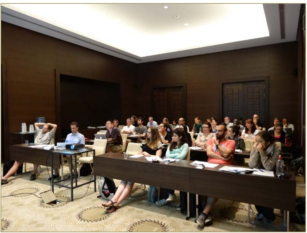
Figure 10: The lecture hall at Costa Navarino for 'The Subtropical Frontier' Summer School

The summer school was a joint collaboration between the Bolin Centre's Research Education division and NEO, with support from THEMES and the Navarino Dunes Hotel. By all accounts it was a success and we hope to hold another such summer school in Navarino soon. For more information about the Stockholm University's Bolin Centre and courses provided goto <a href="http://www.bolin.su.se/index.php/postgraduate-courses">http://www.bolin.su.se/index.php/postgraduate-courses</a> .