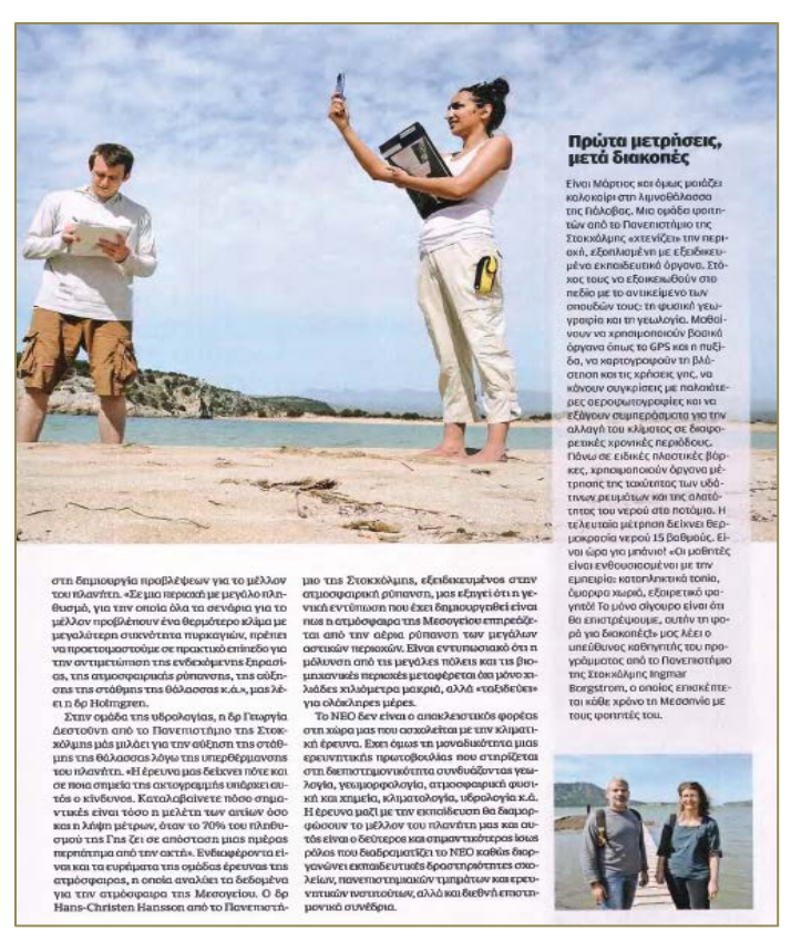
Figure 12: An article about NEO