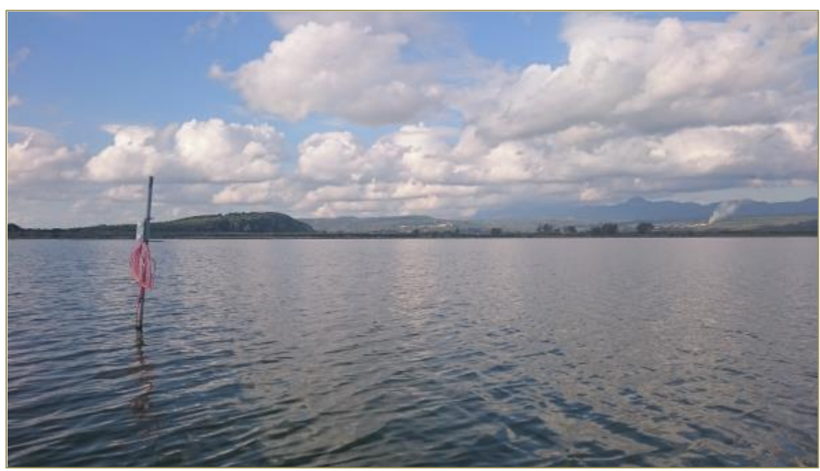
Figure 4. Gialova lagoon – Monitoring station.

channels to the NE side. During the new installations, Agnes and Giorgos also conducted maintenance at the other stations.