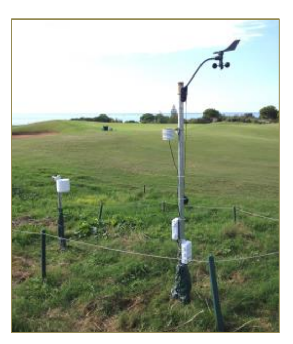
The analyses of the soil water balance at each site has allowed for water demand comparisons.

Crop evapotranspiration rates of the grass at the golf course have usually varied between 1-5 mm/day for the period of low irrigation, and between 4-10 mm/day for the period of intense irrigation. Instead, the rates for the olive orchard have reached at most 5 mm/day, but our method neglected contributions from deep roots, which would have increase the estimated evapotranspiration during irrigation periods. Irrigation has therefore revealed to be a vital water resource for the growth of both traditional (olives) and new (turf grass) vegetation types.