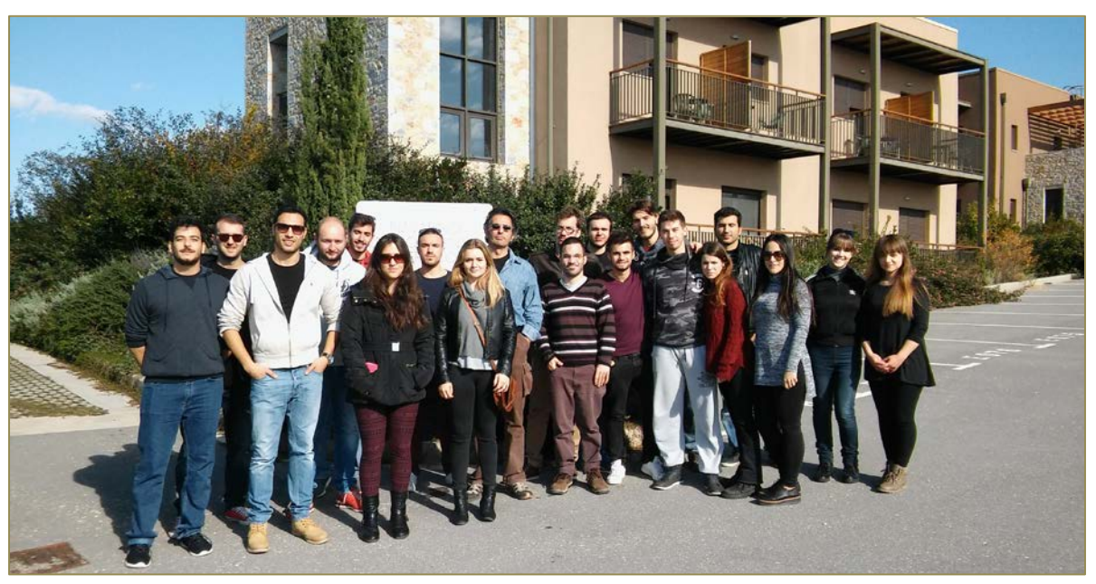
Figure 8: Students from University of Patras

Twenty-two undergraduates from the University of Patras, Greece studying at different Departments (Physics, Mathematics and Geology) of the Faculty of Science participated in the course. They had the chance to follow lectures and train on experimental and computational topics.