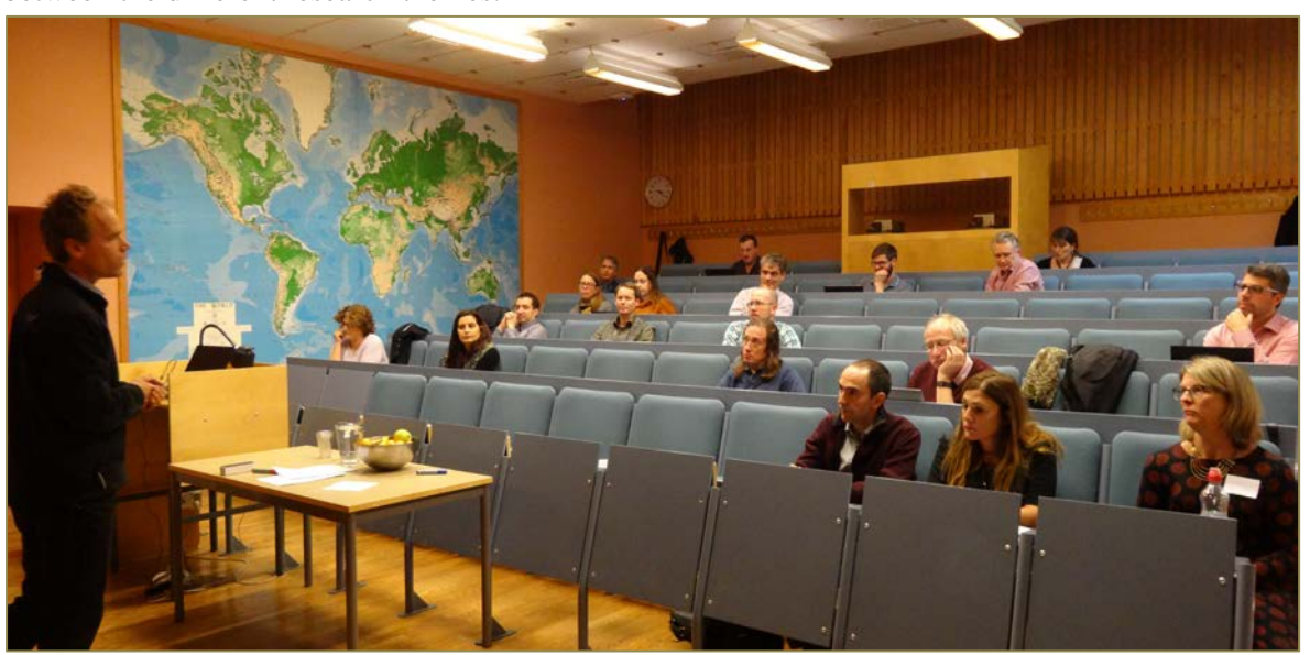
Figure 9: Participants at NEO workshop in Stockholm

The workshop was attended by 23 participants representing the different research themes and partners linked to NEO. The aim of the workshop was to highlight results from research conducted under the NEO collaboration, and to explore possible synergies and the potential for joint synthesis papers between the different research themes.