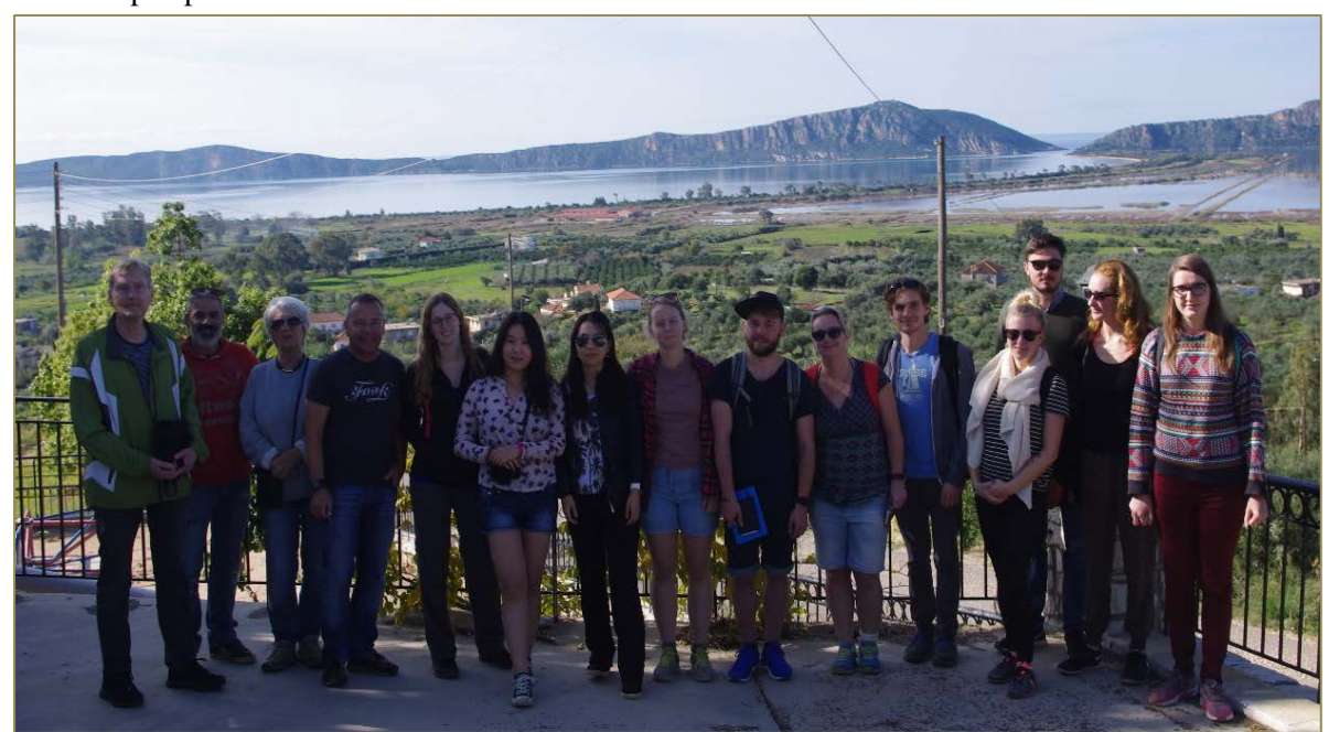
Figure 7. Lectures and students at the master course

In mid-November, a group of four lectures and 10 master students visited NEO for a week. This was a part of the master course Water - resource management in time and space, focus Greece - a collaboration between Stockholm and Linköping Universities and the Swedish Institute in Athens. It is an interdisciplinary course with students from all over the world. The course includes different aspects of water related issues for settlements and water management, where the week in Greece is to from various scientific perspectives carry out a field study on water problems and the role of water in society. The students interviewed farmers, management at DEYA and Costa Navarino resort, as well as citizens and tourists. It was an interesting week discussing water use and management from different perspectives.