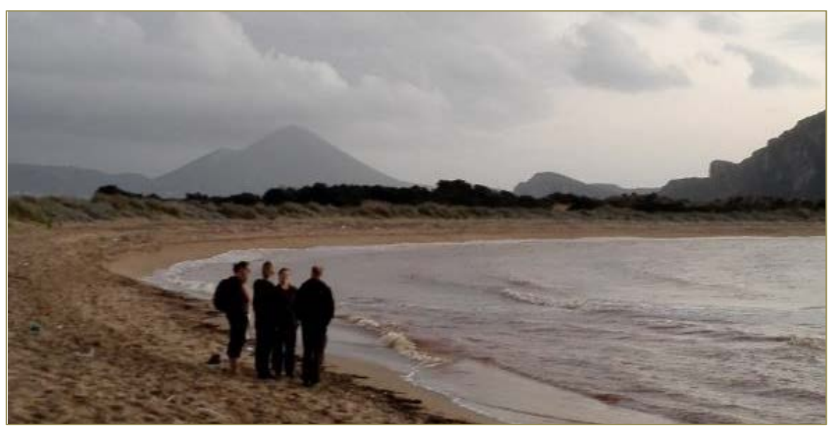
Figure 10: Relaxed discussions next to Voidokilia bay