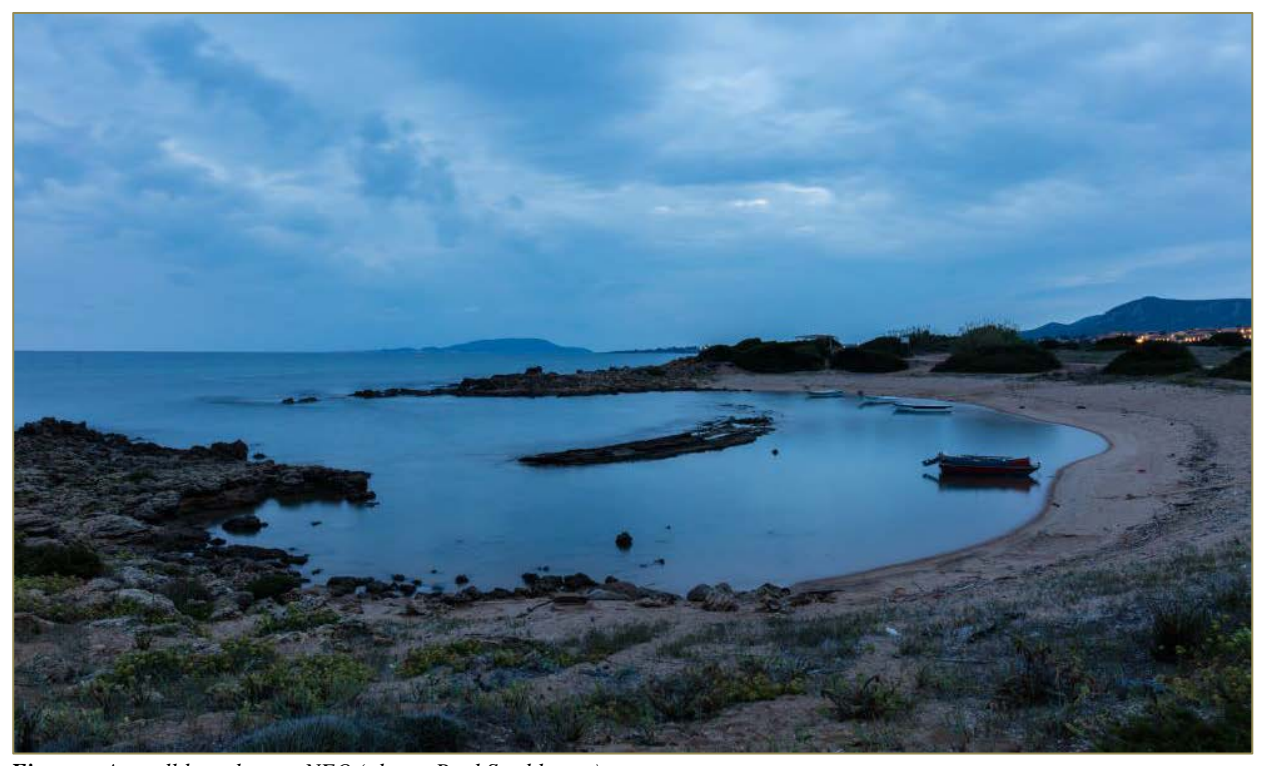
\textbf{\textit{Figure:}} \ \ \textit{A small bay close to NEO}