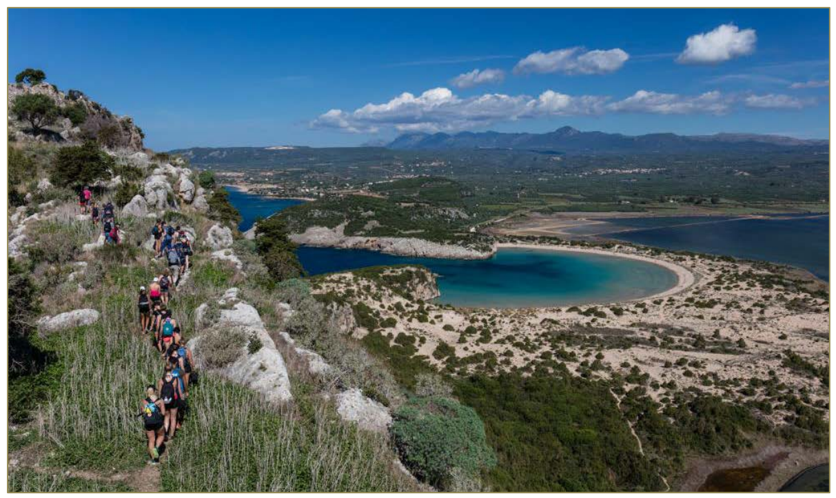
Figure 5. Students from Värmdö Gymnasium walking on Paleokastro

As every year, the focus was the Natura 2000 protected, Gialova Lagoon. The area brings amazing potential for understanding nature preservation from a national and European perspective. Parallels are drawn to similar Natura 2000-protected areas in Sweden, so that the students better understand the rules and regulations surrounding nature conservation. The perspective of the local population was also considered.