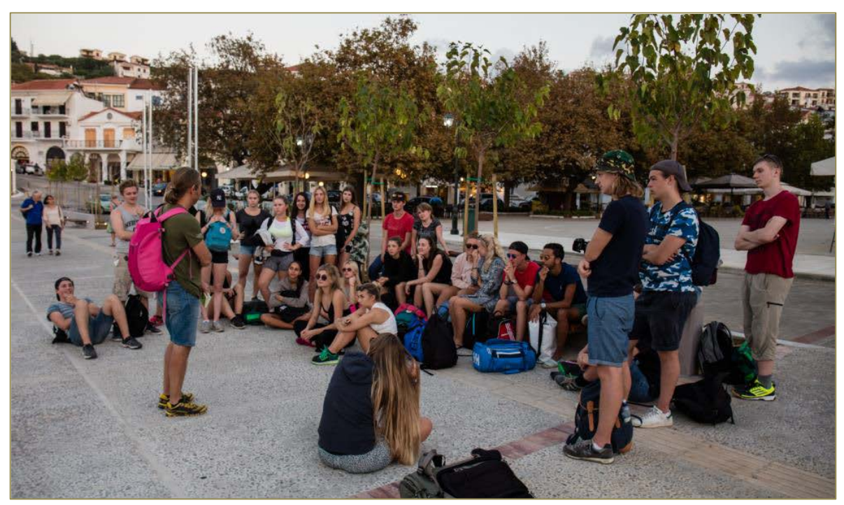
Figure 6: Lecture at Pylos square

"Water – resource management in time and space, focus Greece" Master course, Stockholm and Linköping Universities and the Swedish Institute in Athens (November 13-18)